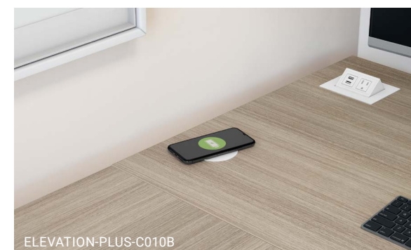
Cutout for wires